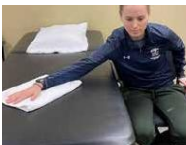
TABLE SLIDE SCAPTION

2 sets, 10 repetitions, hold 10 seconds. 1-2x/day